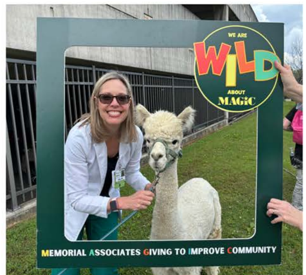
CHI Memorial employees enjoyed a visit from some furry friends - helping us celebrate MAGIC week at CHI Memorial!