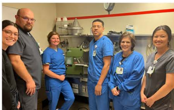
The Pathology Department is pleased with their new bone band saw.

The 2022-2024 MAGIC Campaign supported the Employee Emergency Fund to provide employees with financial assistance during a time of crisis. Since 2003, 594 employees have received help from the Employee Emergency Fund for a total of $393,489. Departments across our three campuses received much needed equipment and program support with grants totaling $318,000. Finally, a third of gifts to MAGIC were earmarked to equip our new Georgia hospital facility set to open FY25.